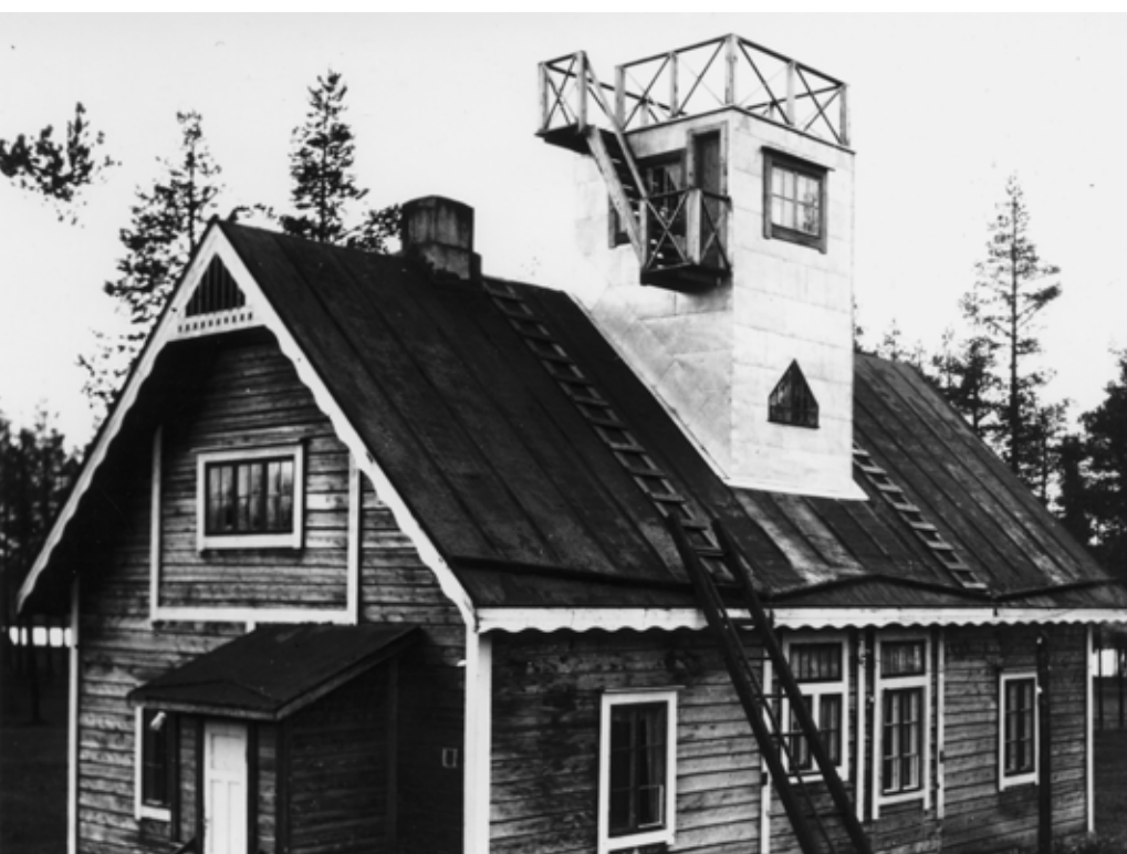
The main building of Sodankylä Geophysical Observatory in 1944 (left) and the ruins in 1945 after the war.