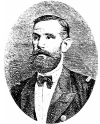
Karl Weyprecht (1838-1881) initiator of the Polar Year. Died before the Year started.